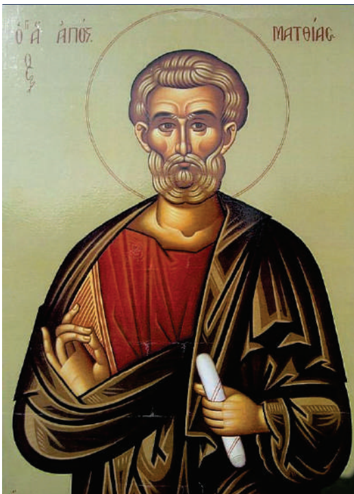
St. Mathias - Pray for us!